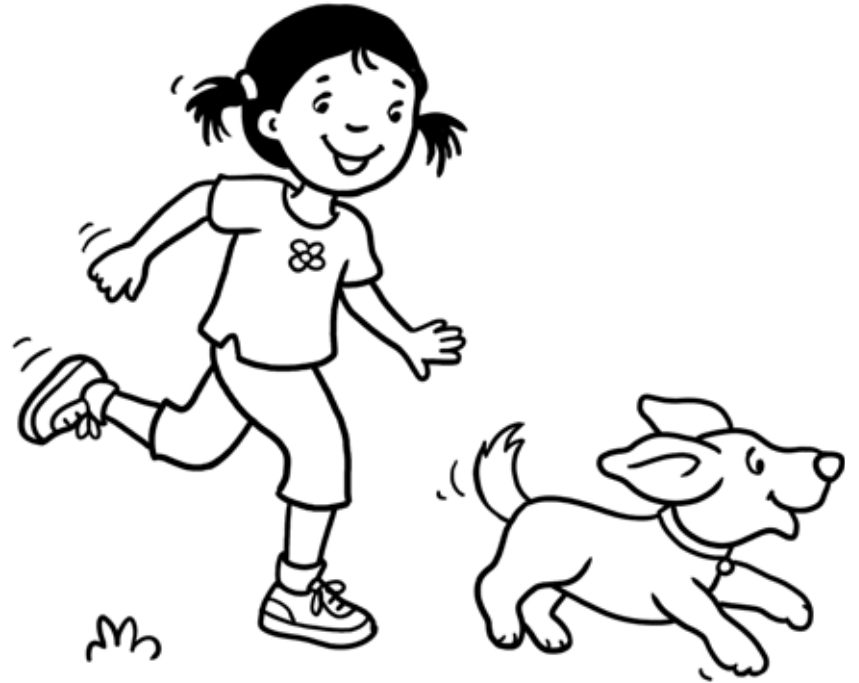
She can run fast.