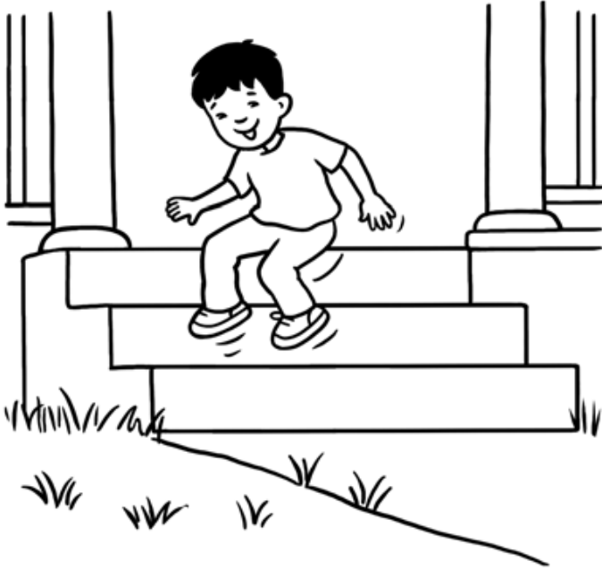
He can hop.